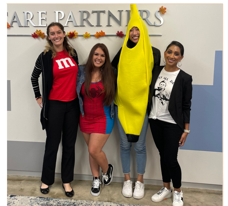
Transitional Medicine Team